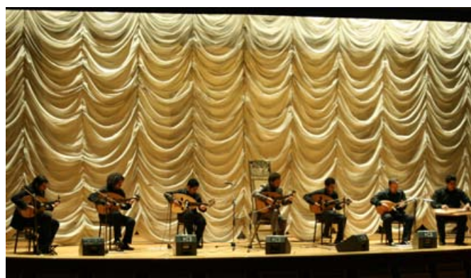
Concert at the Syndicate of Journalists with Naṣīr Shamma and Beit al-‘Ūd Ensemble (April 2009)