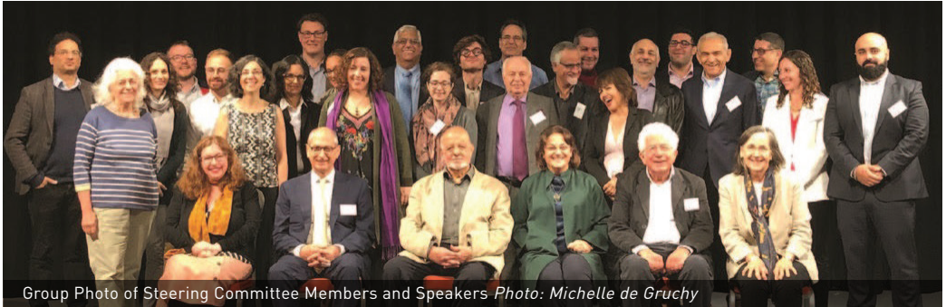
Group Photo of Steering Committee Members and Speakers