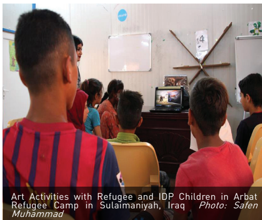
Art Activities with Refugee and IDP Children in Arbat Refugee Camp in Sulaimaniyah, Iraq