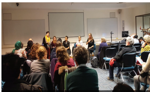
Exeter Literary Festival